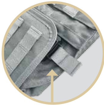
QUICKLOC SIDE ATTACHMENT SYSTEM