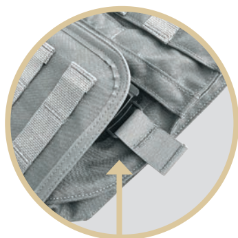
QUICKLOC SIDE ATTACHMENT SYSTEM