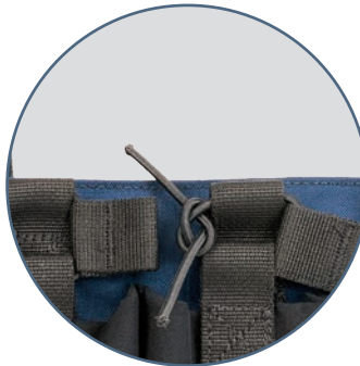
INSIDE FLAP DETAIL