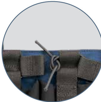
INSIDE FLAP DETAIL