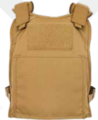
FRONT NO CUMMERBUND