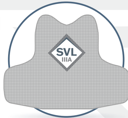
SHOWN IN DELTA CUT