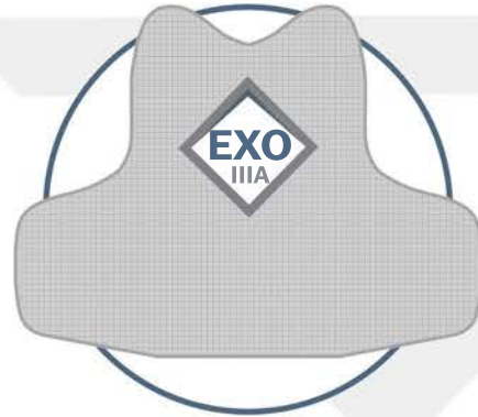
SHOWN IN DELTA CUT